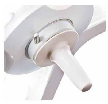
Sterilizable Center Handle Extremely smooth focus mechanism